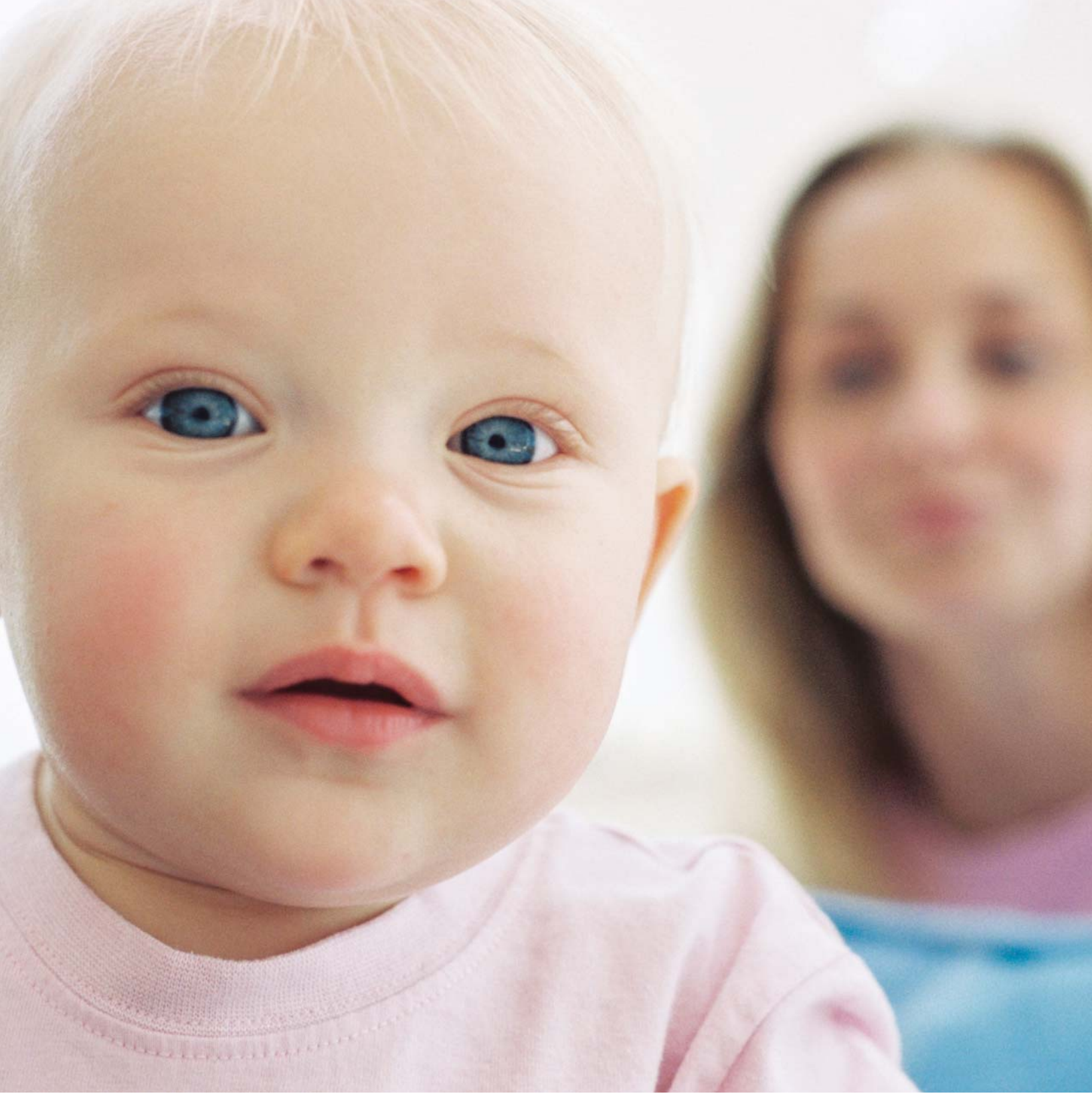
a message to my child

Why we saved your stem cells with Stembanc when you were born.